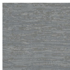
Talc 33535 LRV 18.9