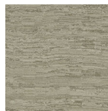
Element 33506 LRV 18.6