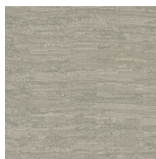
Alabaster 33111 LRV 24.3