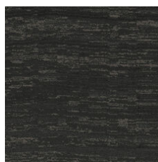
Onyx 33505 LRV 2.2