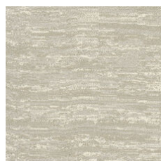
Carrara 33100 LRV 46.6