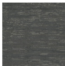
Slate 33595 LRV 5.9