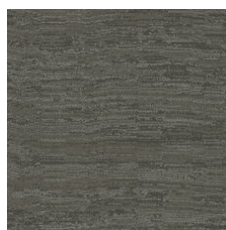
Cornerstone 33555 LRV 8.1