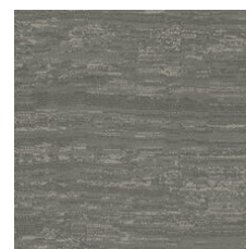
Forge 33518 LRV 12.9